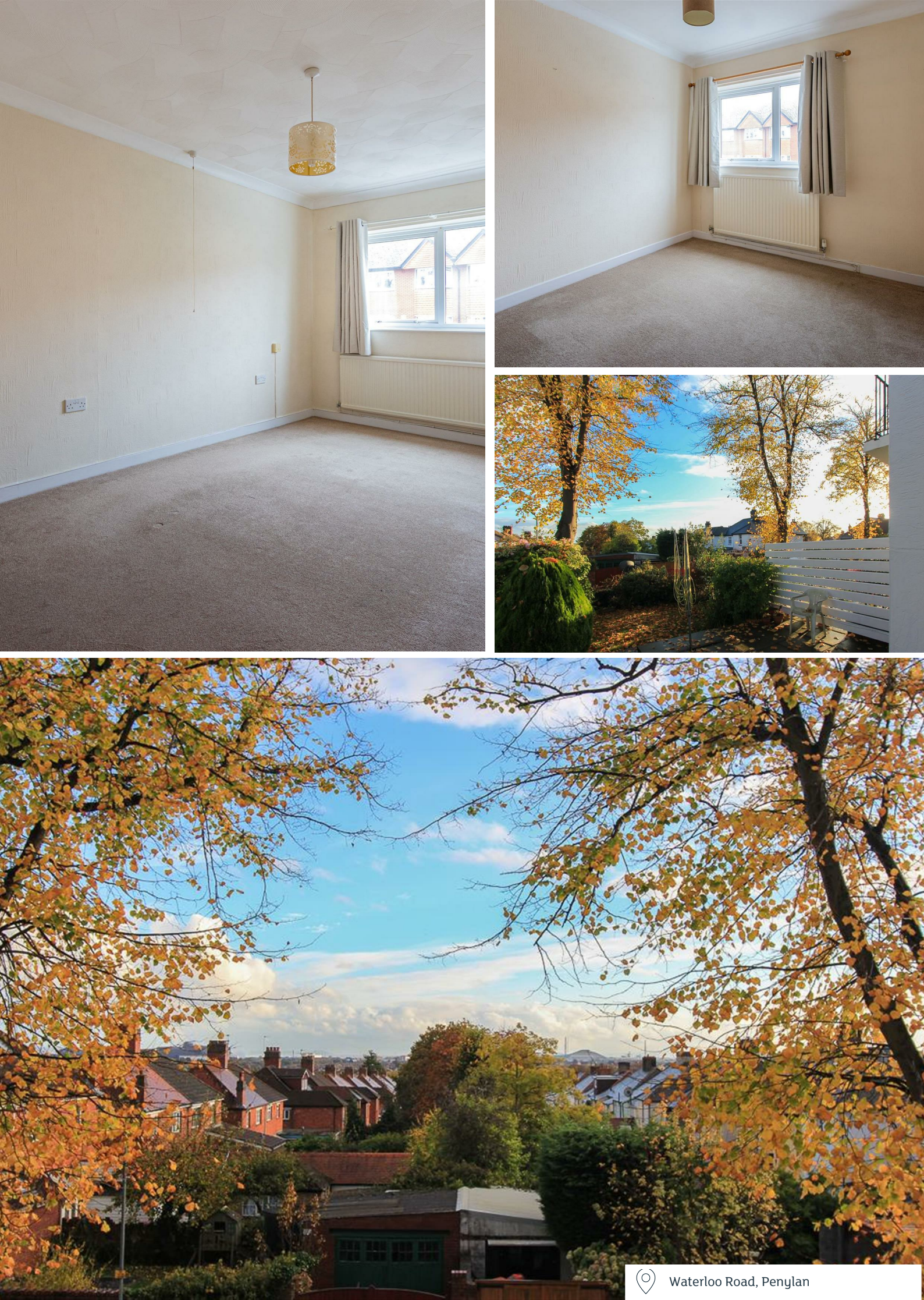
Waterloo Road, Penylan